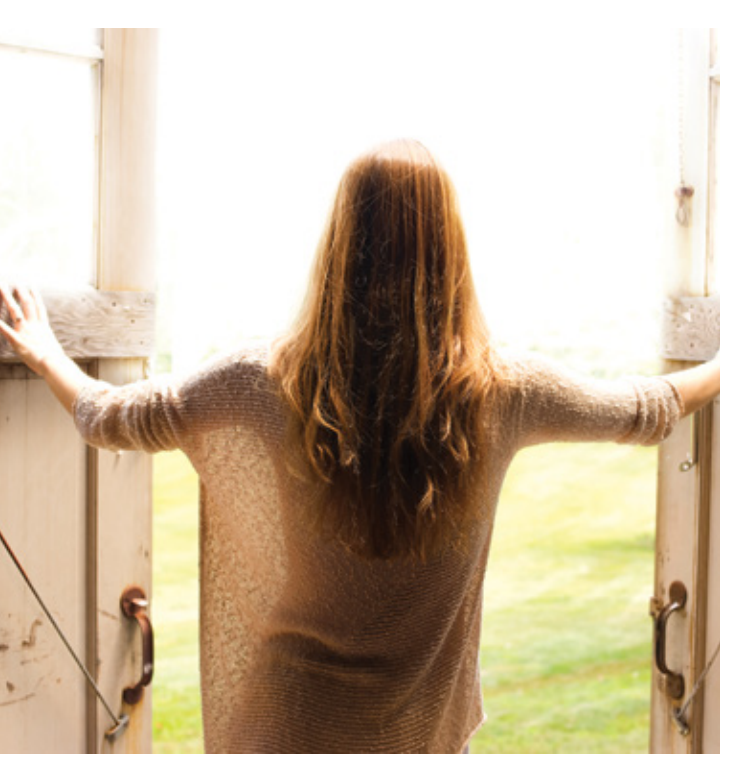
EXHALE'S TRANSFORMATIONAL PACKAGES + JOURNEYS

Immerse yourself in wellness with dedicated programs crafted by exhale's experts. Find flawless skin, reshape your body, define your diet, and restore your mind with proven curriculums. Our knowledgeable teachers, therapists, and healers join you on your journey and guide you to your goals. Get ready to revive, restore, and transform.